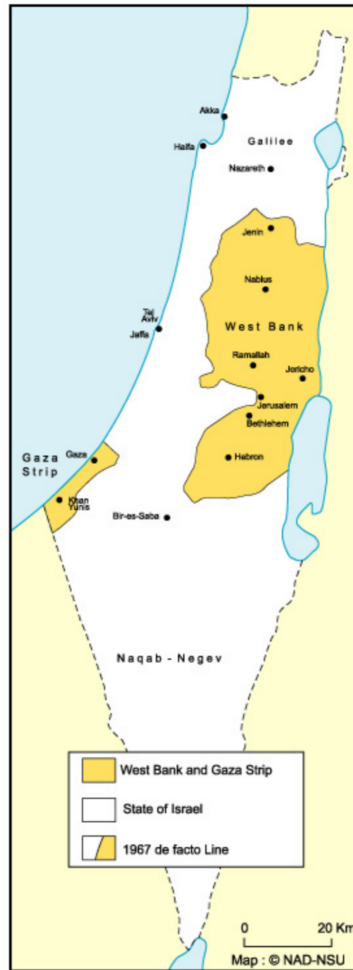
1967 De Facto Line 22% of Historic Palestine