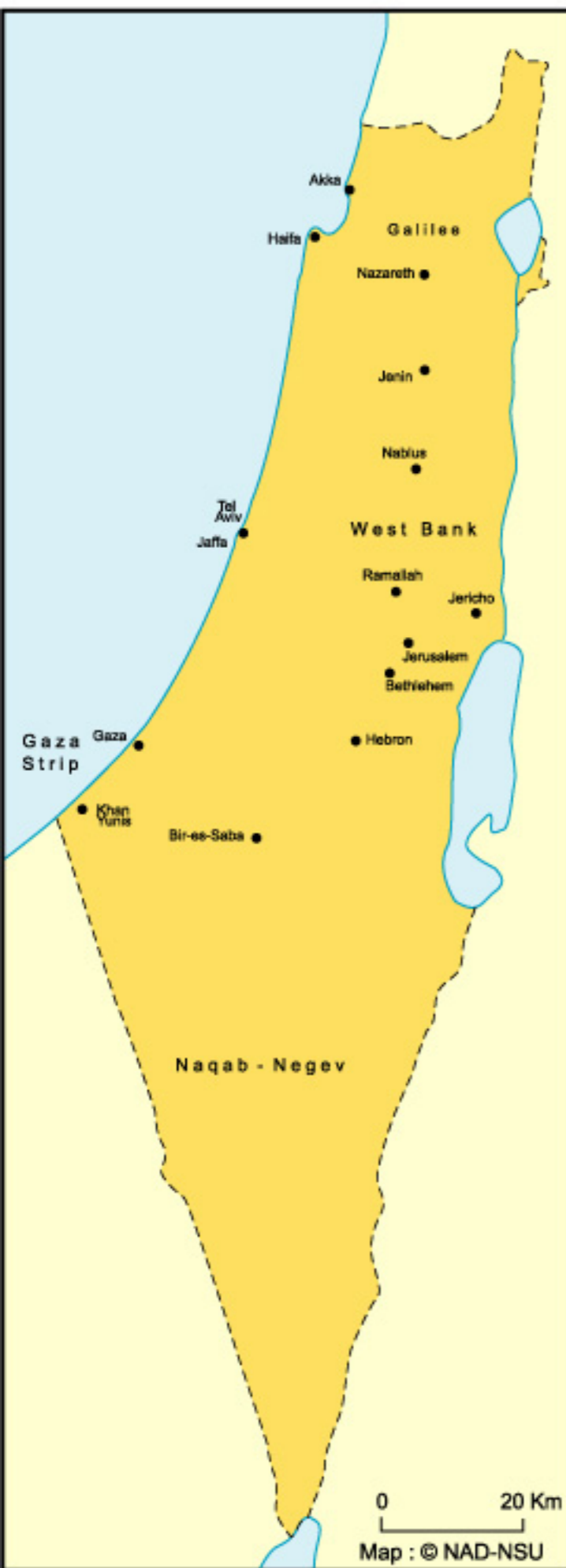
Pre-1948 100% of Historic Palestine