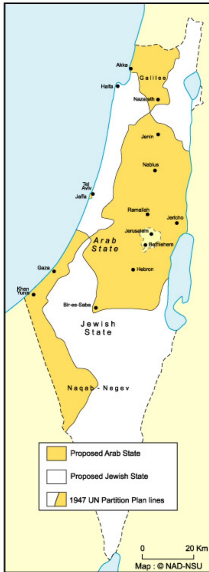
1947 UN Partition Plan 48% of Historic Palestine